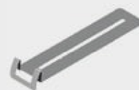
CL-W - Perimeter Spacer Clip